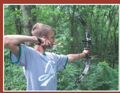
Member participating in the National 4-H Shooting Sports Invitational, the national level competition in all of the disciplines.